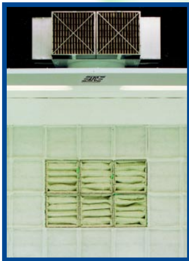
Three Stage Filtration