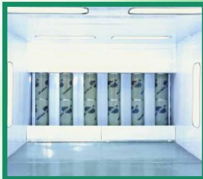
Powder Coated Cartridge Booth

Manual or automatic feed application systems are available.