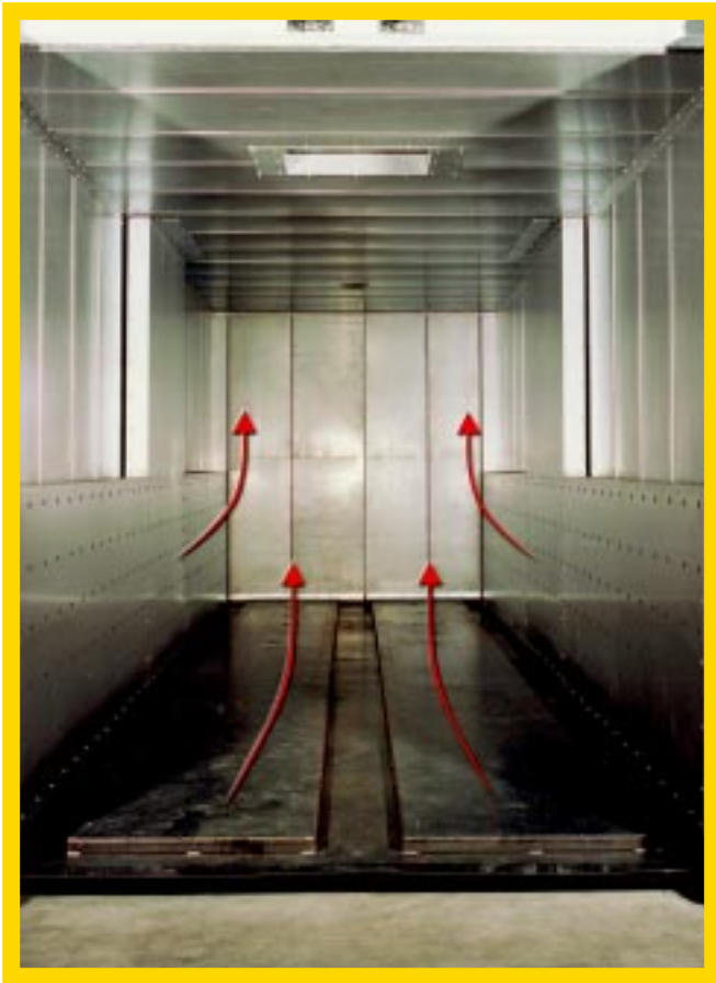
Aluminized Oven Interior