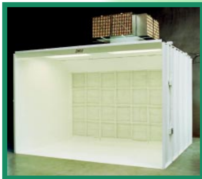
Pocket Filter Booth