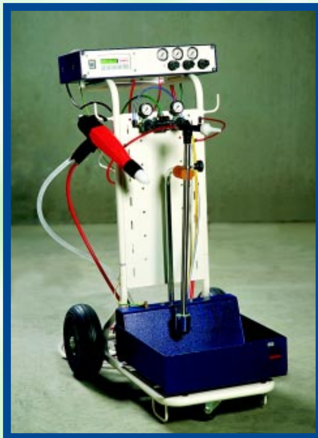
Electrostatic Powder Applicator