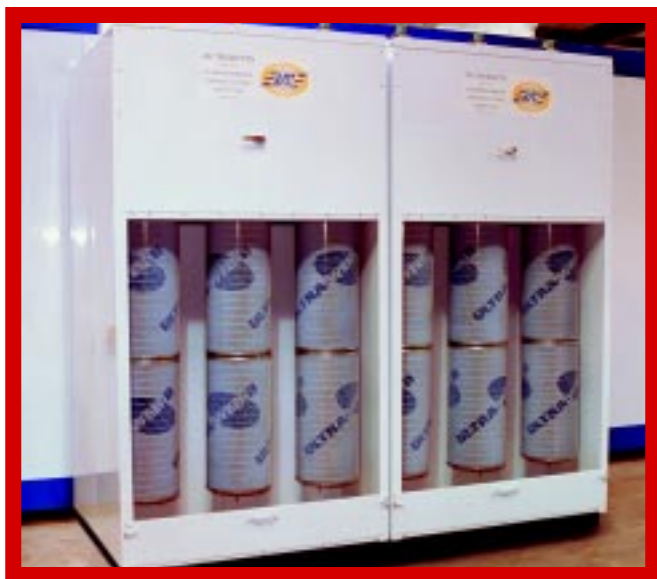
Powder Coating Modules

AFC's pocket filter booths feature three-stage filtration. The primary filtration is handled by polyester and the secondary filters are a pocket style also of polyester material. The final filtration, before allowing the air back into the work area, is handled by way of condensed paper media. These pocket filter booths can be ordered in either a galvanized or powder coated finish.